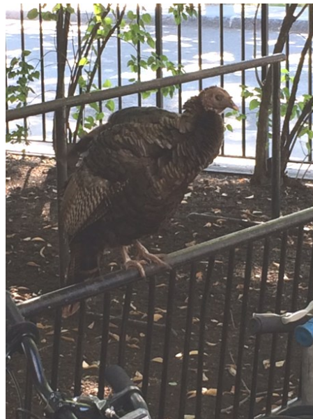
"Wild" turkey female perches on Leverett House bike rack.