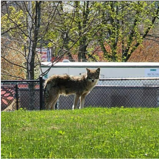
135 Western Ave.