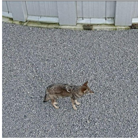
District Energy Facility