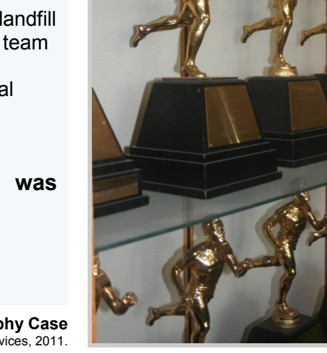
Trophy Case