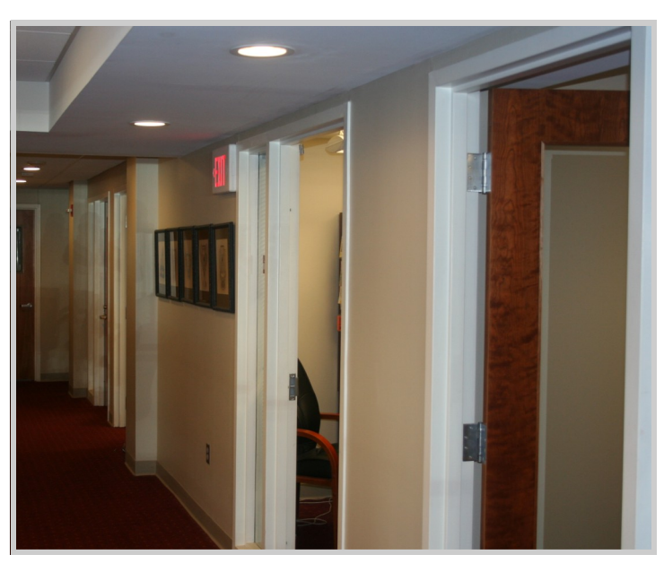
Gordon Track Offices Photo: Harvard Green Building Services, 2011