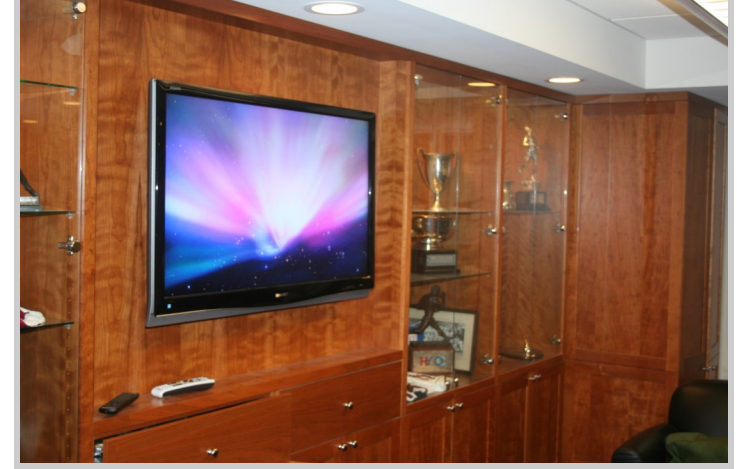
Gordon Track Energy Star LCD Screen/Trophy Case