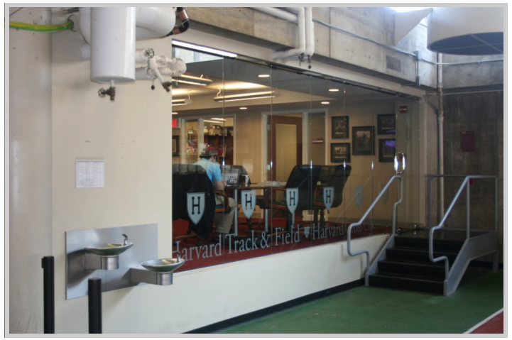
Gordon Track Lounge