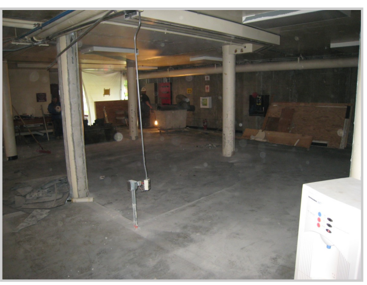
A Clean Construction Site

GREEN HOUSEKEEPING: The Gordon Track and Tennis Facility participates in Harvard's Facilities and Maintenance Operations (FMO) Green Cleaning Program, which uses 100% recycled paper products and Green Seal certified cleaning solutions, among other green housekeeping practices.