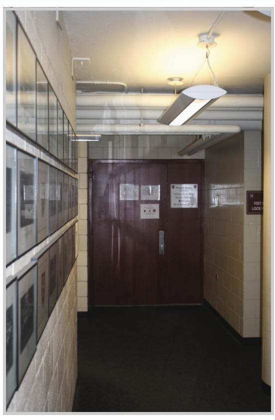
Pendant Lights with Low Hg Linear Fluorescent Lamps