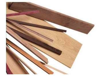
Engineered Hardwood Flooring TreeSmart

✓ VOC content: 2.39 g/L, which is significantly lower than industry baseline of 350 g/L