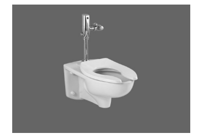
Flushometer Toilet System AFWALL® FloWise® American Standard