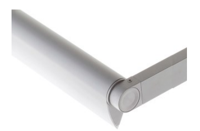
Ceiling-Wall Arm LED WingRail

Vode Lighting ✓ High efficiency: 102 lumens/watt