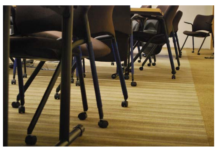
Materials and Furnishings