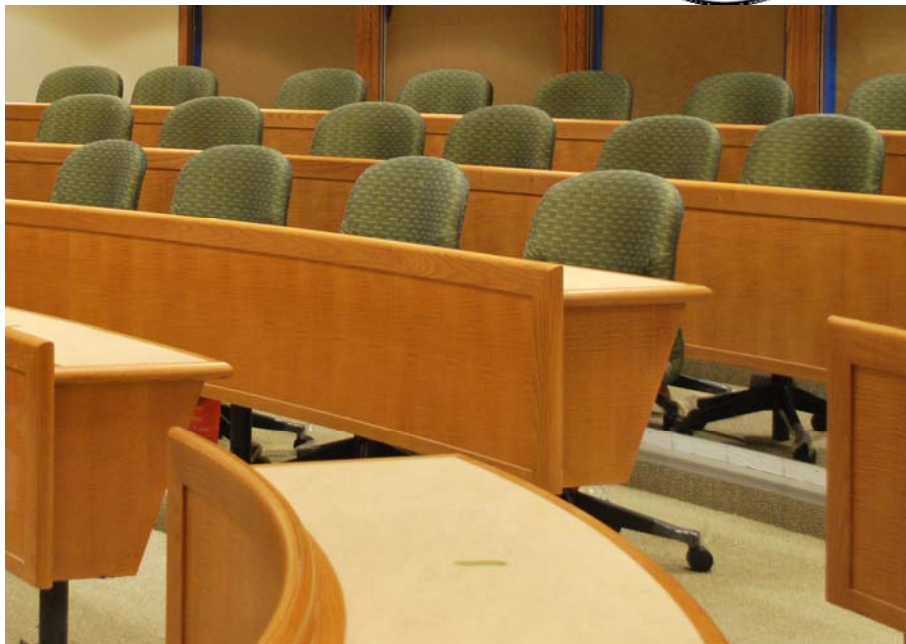
Larsen Classrooms

HGSE is committed to sustainability and reducing greenhouse gas emissions. The project achieved LEED for Commercial Interiors (LEED-CI) version 2.0 Platinum certification, the highest certification level possible.