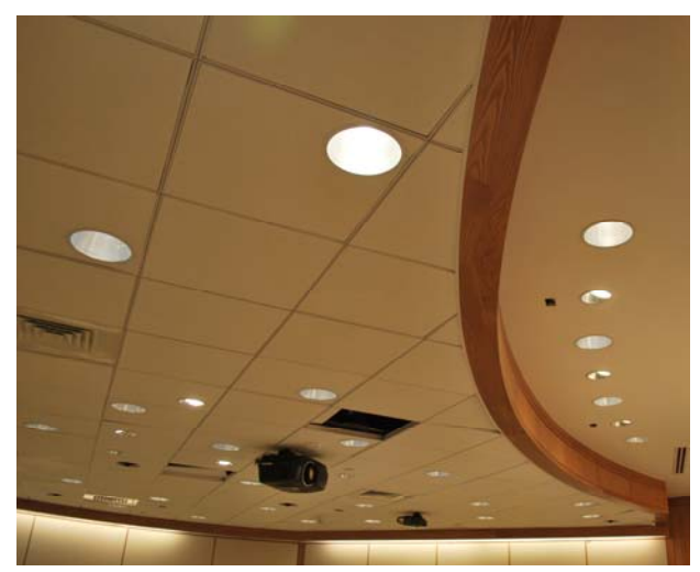
Lighting and Controls Photos: Harvard Office for Sustainability. 2009